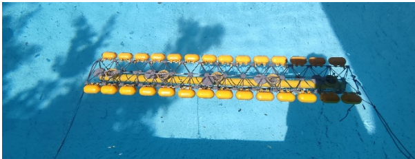
Figure 3.- Laboratory-scale physical model.

The resulting physical model build according to the geometrical scale is presented in Figure 3 .